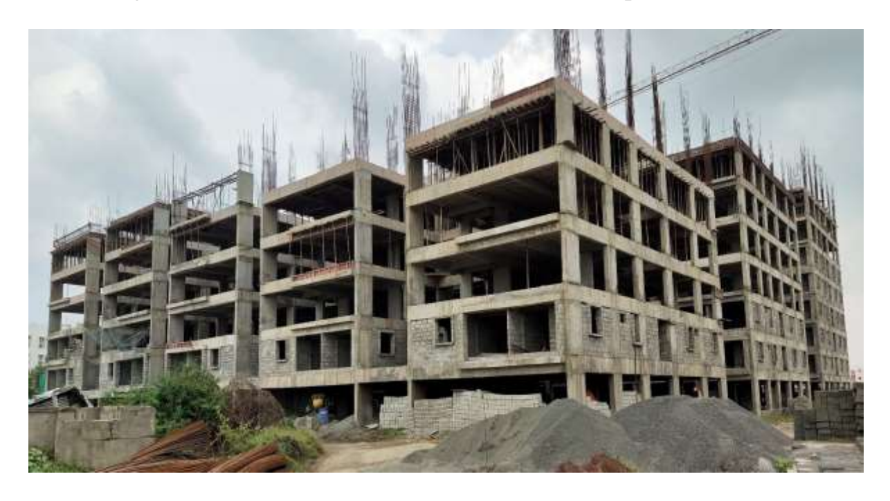
Block D1: Columns upto Third floor level 50% completed. Shuttering & Barbending works for 1<sup>st</sup> half of Third floor level 25% completed.

Block C3: Columns upto Sixth Floor Level 50% completed. Shuttering and barbending work for 1<sup>st</sup> half of Sixth floor level 15% completed.