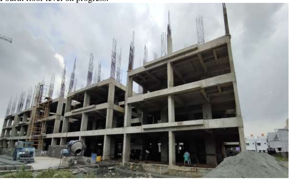
Block A2: Second Floor Level slab concrete casting 100% completed.

Block A1: Third Floor level slab Concrete casting 100% completed. Columns upto Fourth floor level on progress.