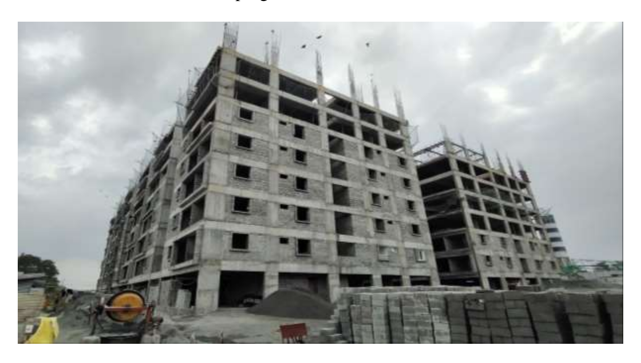
Block C2: Seventh Floor level slab concrete casting 100% completed. Column casting upto Eight floor level 15% completed and balance work on progress.

Block C1: Eight Floor Level slab concrete casting 100% completed. Barbending works at Ninth floor level on progress.