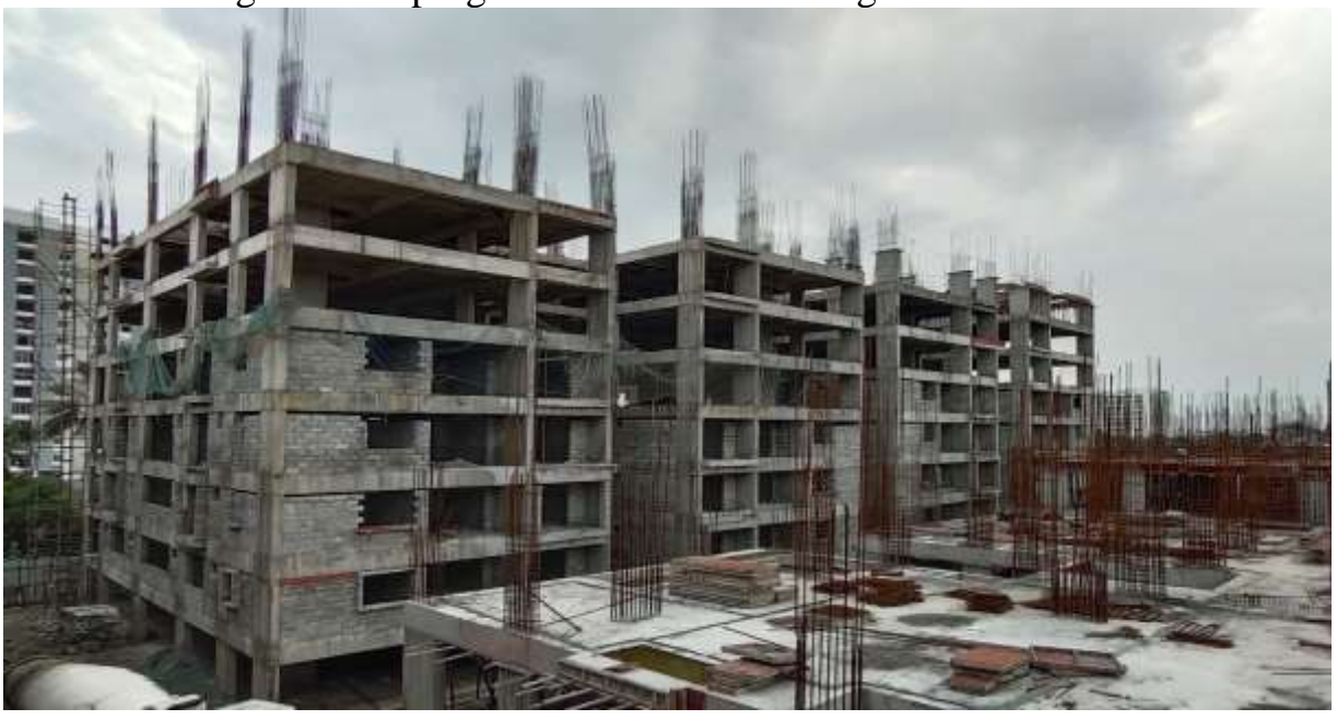
Block D3: Fifth floor level slab concrete casting 100% completed. Columns concrete work upto sixth floor level on progress.

Block D2: Columns upto Eight floor level concrete casting on progress. Shuttering and barbending work on progress for First half of Eight floor level sab