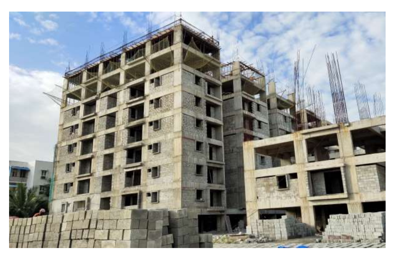
Block B2: Third Floor Level slab concrete casting 100% completed. Bar bending works for Columns up to fourth floor level on progress.

Block B1: Eight Floor Level slab concrete casting 100% completed. Shuttering and Barbending work for Ninth floor level on progress.